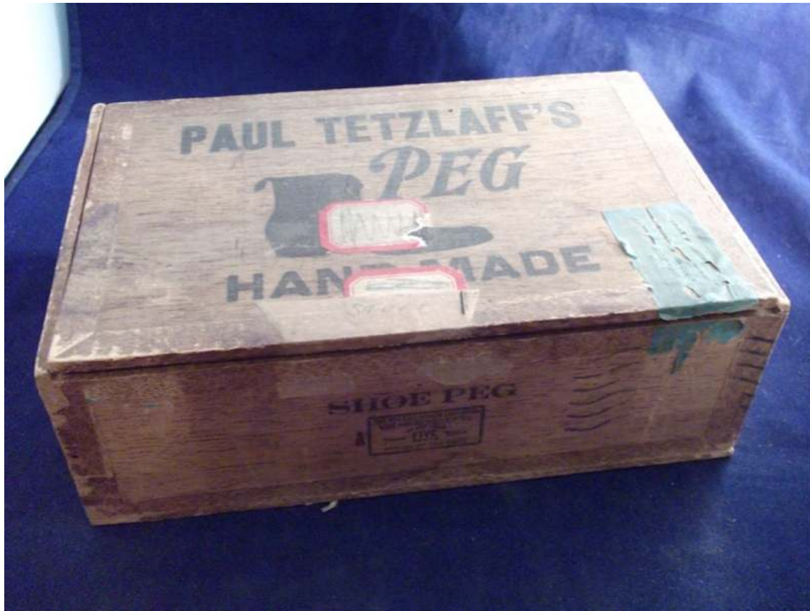
Paul Tetzlaff Cigar Box (For sale on eBay in 2012)